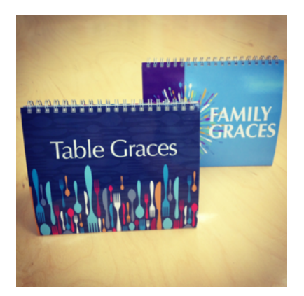
Table Graces and Family Graces

Published by Forward Movement, 2014 <a href="https://www.forwardmovement.org/Products/2261/table-graces.aspx">www.forwardmovement.org/Products/2261/table-graces.aspx</a>